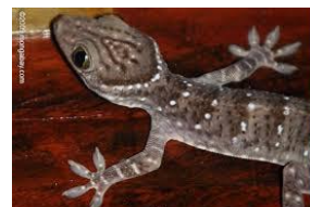
STRIPED HOUSE GECKO