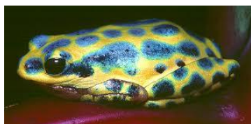
LAKE NABU REED FROG