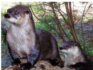
NILE RIVER OTTER