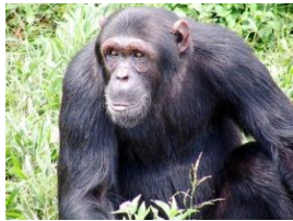
CH IM PA NZ EE