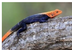
RED HEADED AGAMA LIZARD