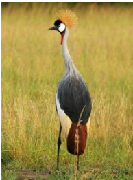
GREAT CRESTED CRANE

Cut & paste any of these pictures to your letter, add photos of your own, or draw the animals.